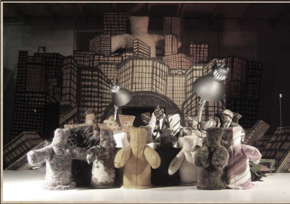
In the photo: the cast of Foffzilla at the shows finale during Dutch Design week